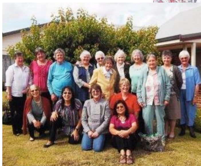
BTH Ladies Club at their 50th anniversary reunion in 2001.

For many years the ladies were the main catering